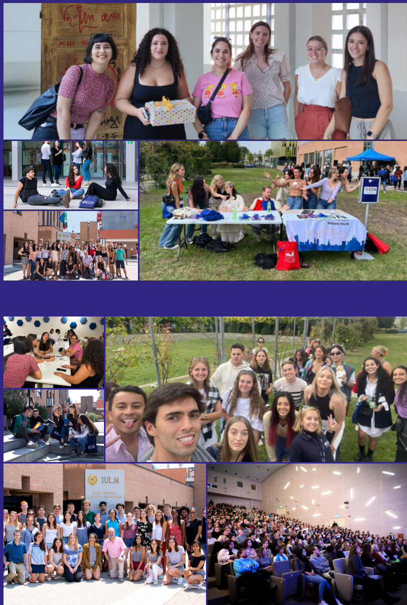
Some of our Welcome Days

Look at this video to witness some of their experiences.